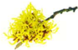
WITCH HAZEL WATER