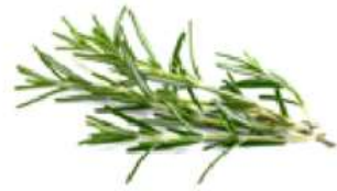
TEA TREE EXTRACT