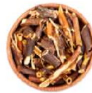
MORUS BARK EXTURACT